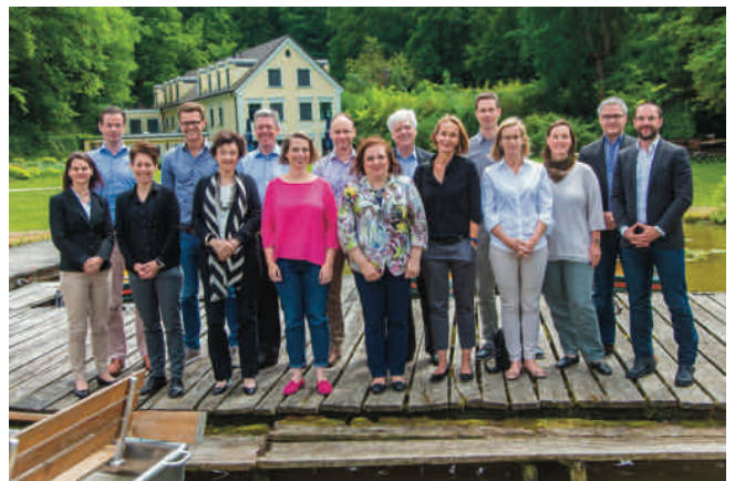
The group of Seminar 19 at the beautiful lake in Alt-Madlitz.